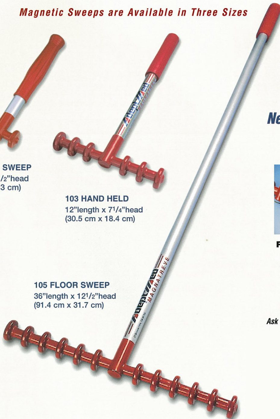
105 FLOOR SWEEP 36"length x 12 1/2"head (91.4 cm x 31.7 cm)