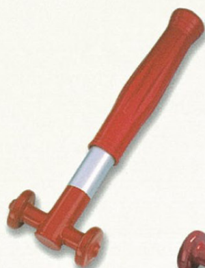
100 TEENSY SWEEP 8"length x 2 1/2"head (20.3 cm x 6.3 cm)

Magnetic Sweeps are Available in Three Sizes