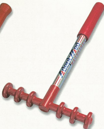
103 HAND HELD 12"length x 7 1/4"head (30.5 cm x 18.4 cm)